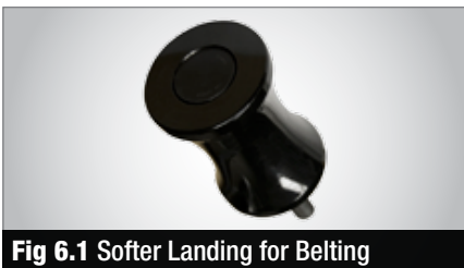
Fig 6.1 Softer Landing for Belting